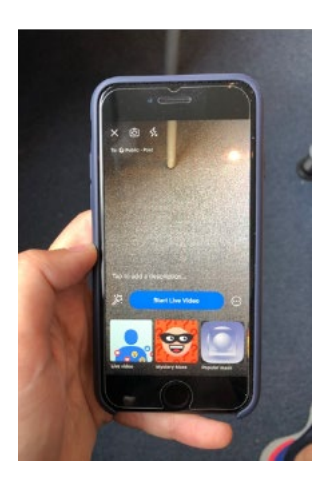
Views of the phone in portrait mode – a bad position

To do so, take your phone in your hands as you would normally hold it to send a message, tilt your phone 90 degrees to the left, so the lens is on the top of the back of your phone.