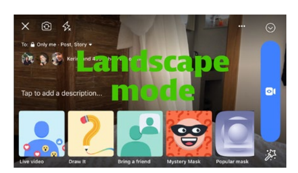
Good phone orientation

To do so, take your phone in your hands as you would normally hold it to send a message, tilt your phone 90 degrees to the left, so the lens is on the top of the back of your phone.