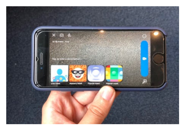
Views of the phone in landscape mode – a good position. See the lens on the top corner of the camera