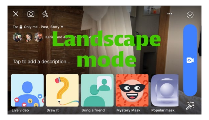
Note the rotation of all options buttons when in landscape mode – a good position

IMPORTANT: Note that your phone will not go into landscape mode if you have locked phone rotation mode. If you lock the rotation, the live stream will go back to portrait mode. Make sure to unlock the rotation in your phone settings.