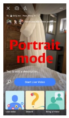
Bad phone orientation

The live stream will keep the same orientation until it ends. Before starting your live, you have to make sure that you are in the correct position. You have to position your phone in landscape mode before hitting the GO LIVE button.